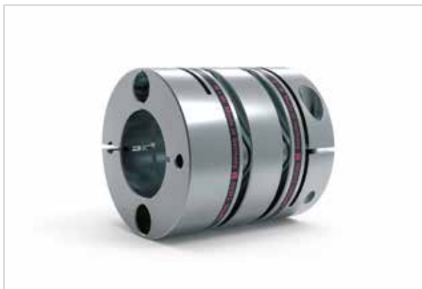
SCL2 with clamping hub

The servo disc pack coupling is suitable for dynamic drive tasks involving frequent stopping and starting as well as reversing operations, where the focus is on absolute positioning accuracy. Its hubs are made of aluminum, delivering low weight and low moment of inertia. The disc packs themselves are made of highly elastic spring steel and feature a high degree of power density. High-strength screws, that transmit torque via a frictional connection, are used to fasten the disc packs – absolutely backlash-free. Micro-movements do not occur in the disc pack connection, which delivers a high degree of overall rigidity. The shaft-hub connection is only available in a friction-locked format with a clamping hub, split clamping hub or conical clamping ring.