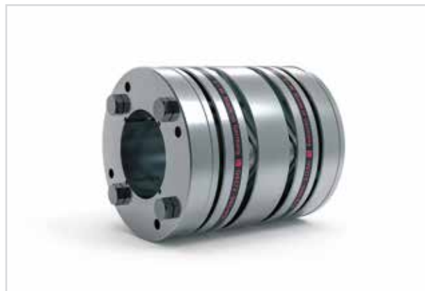
SCL3 with conical clamping ring