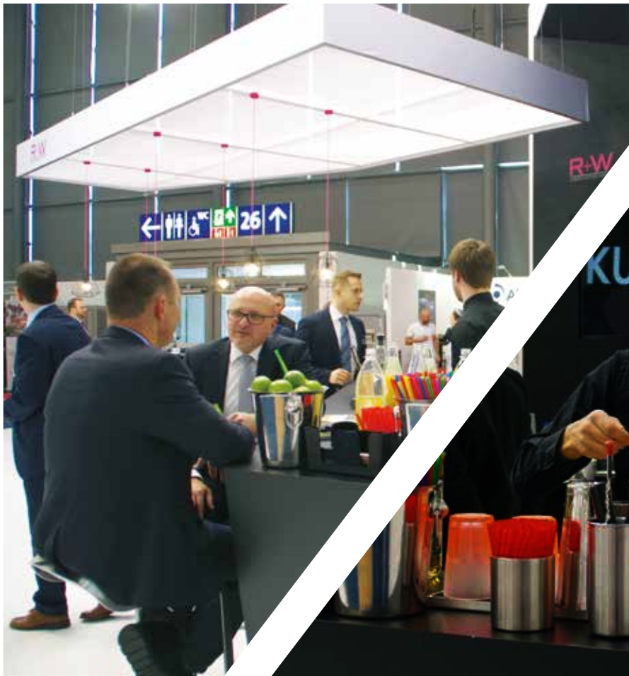
Delicious! Once again a bar-keeper mixed tasty cocktails.