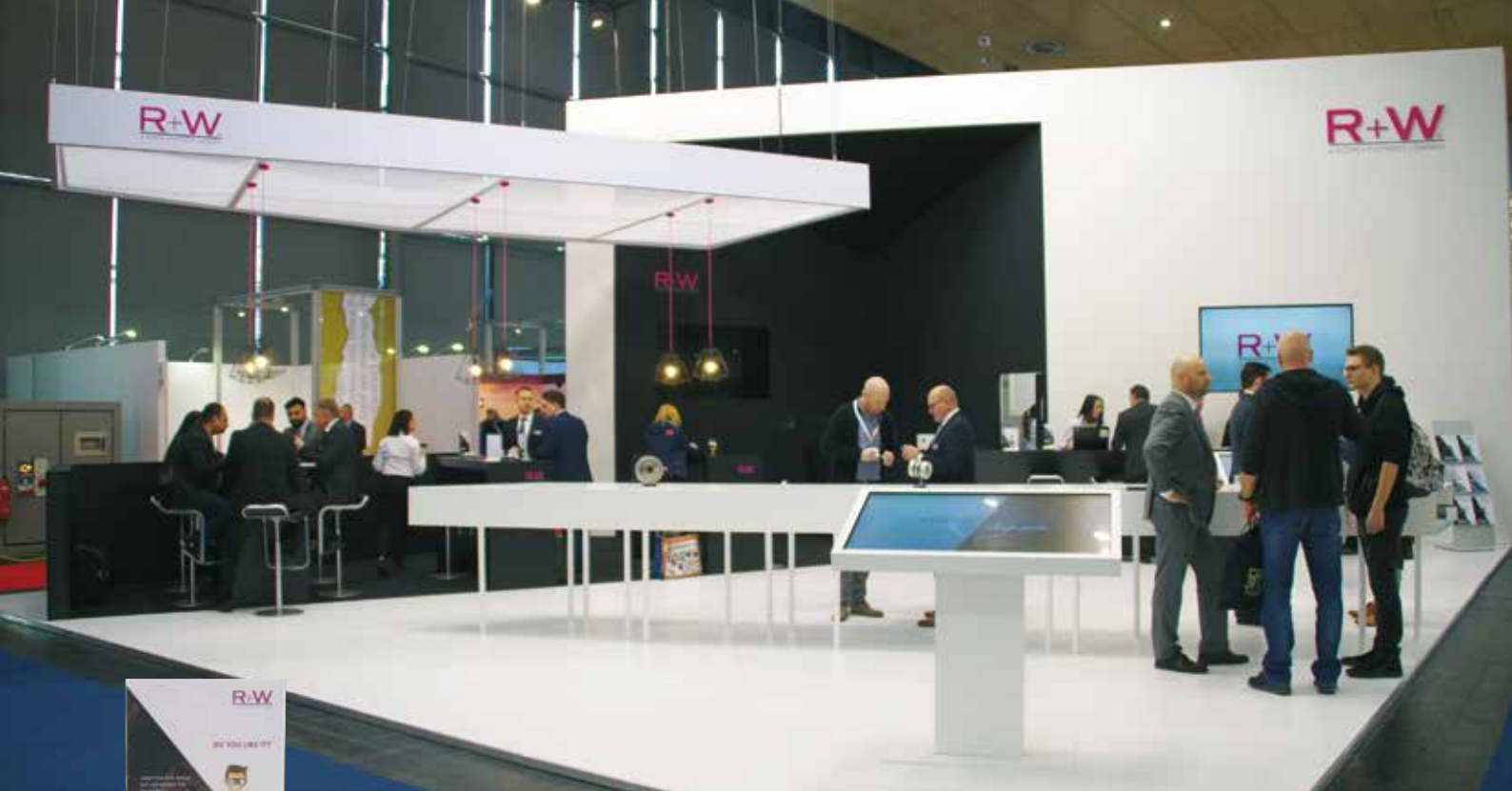
R+W presented itself spacious, airy and relaxed at the Hannover Messe.